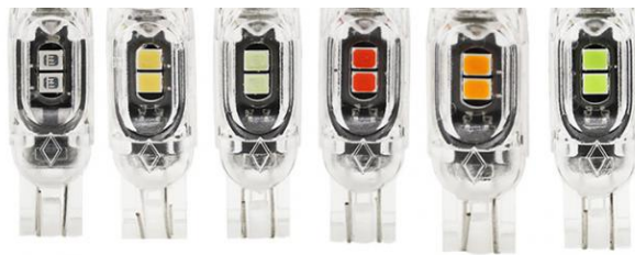
冰蓝 蓝色 白色 红色 黄色 绿色