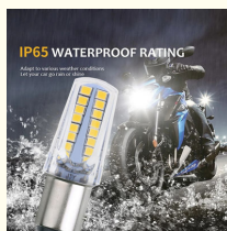
High brightness LED chip, high brightness, full light color High quality LED lamp beads