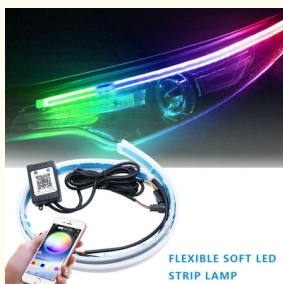
FLEXIBLE SOFT LED STRIP LAMP