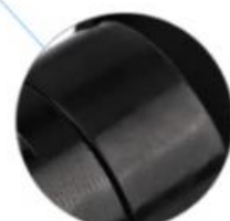
High Quality Aluminum