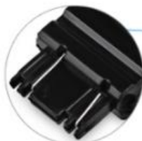
3157 Standard Socket