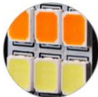
3157 Dual Color Chip