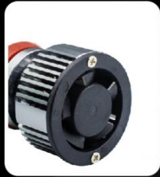
Turbo cooling fan