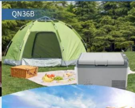
Breast milk preservation