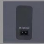
12V/24V dual voltage interface